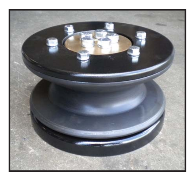
Weight: 82 lbs